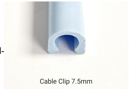
Cable Clip 7.5mm